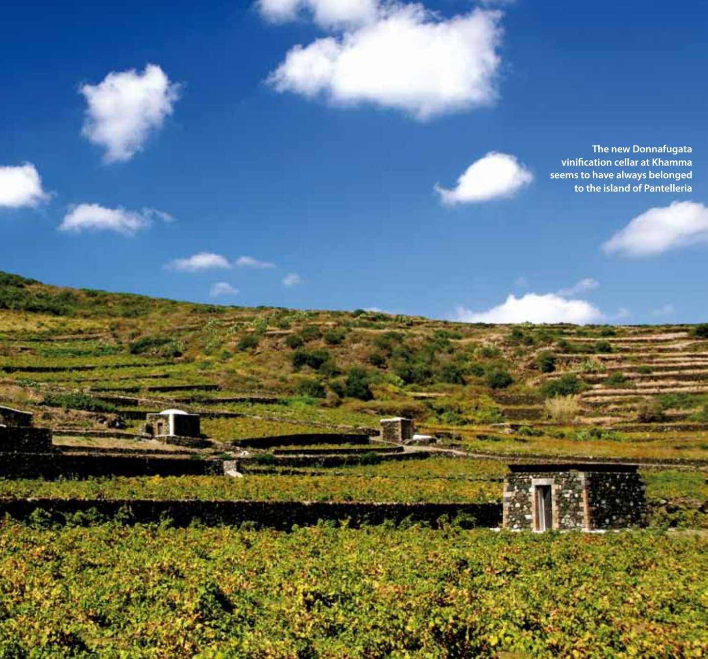
The new Donnafugata vinification cellar at Khamma seems to have always belonged to the island of Pantelleria