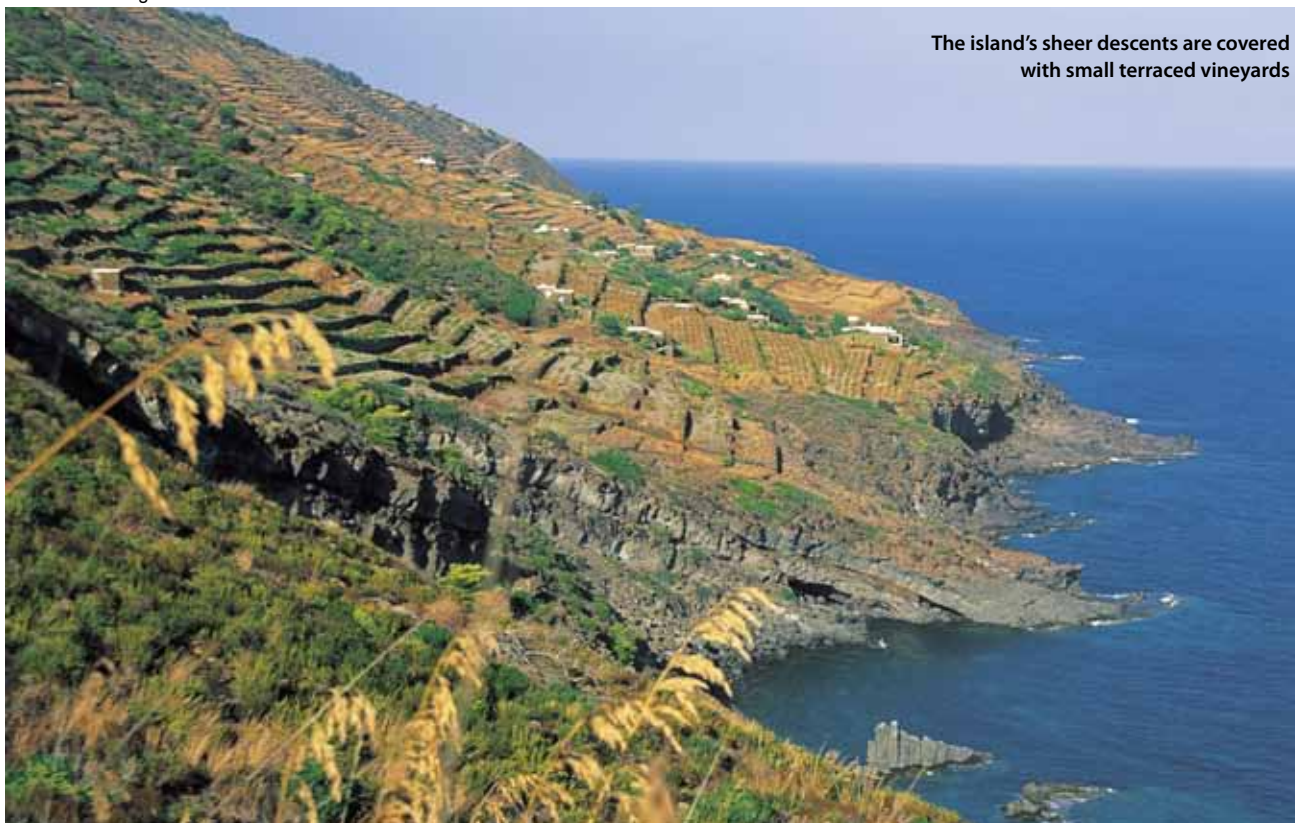
The island's sheer descents are covered with small terraced vineyards

THE GRAPES ARE HARVESTED FROM THE END OF JULY TO THE END OF SEPTEMBER. HARVEST STARTS WITH THE FIRST GRAPES TO BE PICKED ON THE SOUTH-FACING VINEYARDS AT SEA LEVEL. MUCH CARE IS TAKEN TO SELECT ONLY THE HEALTHIEST GRAPES