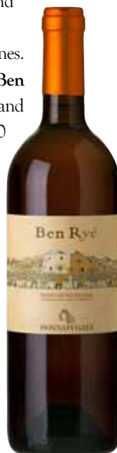
Ben Ryè Passito di Pantelleria DOC

“So come to Pantelleria and forget about time. Immerse yourself in this magical Mediterranean island and enjoy the nectar of the gods!” she says. ♦