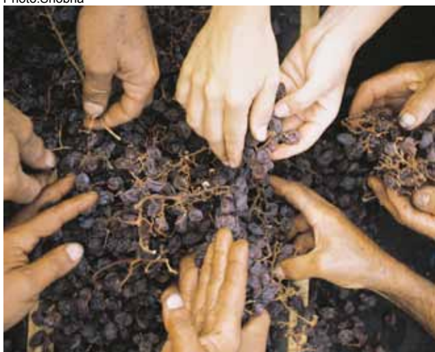
Zibibbo grapes withered in the sun and wind and turned into Malaga. Every grape is removed from the bunch by hand, checked and selected

maximum of 400 metres above sea level with vines as old as 100 years.